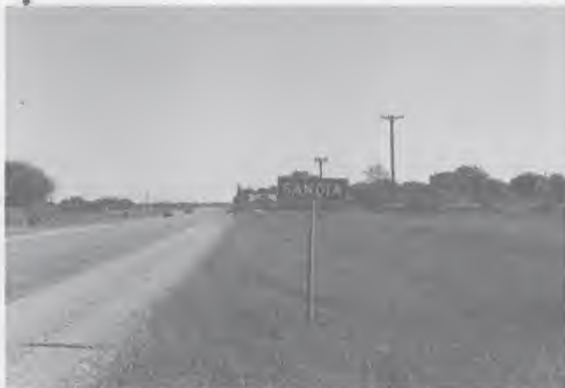
SO YOU THINK YOU KNOW SANDIA — Question: Where was this photo taken? See Page Thirteen for the answer.